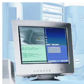
Real-time quad view

Be more productive, organized and efficient with the dynamic new QuadraVista Quad video KVM Switch from Rose Electronics.